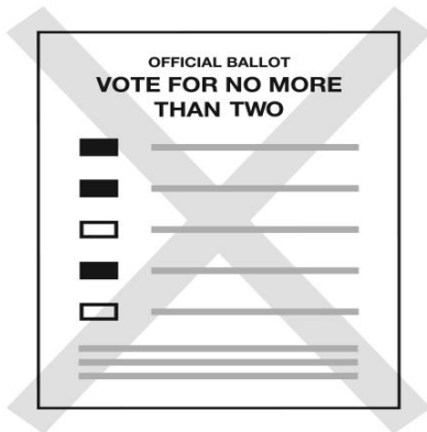
Don't vote for too many

If you spoil your ballot and wish another sent to you, place the spoiled ballot in the return envelope and immediately return it to the Sierra County Clerk's Office. Be sure to check the box marked "spoiled" on the return envelope and sign your name in the space provided.