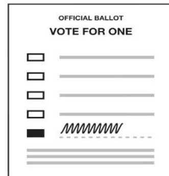
Always darken the box, even on a write-in vote